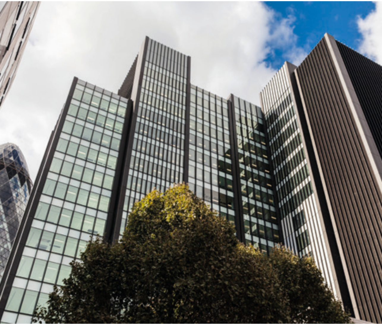
ONE CREECHURCH PLACE, LONDON EC3