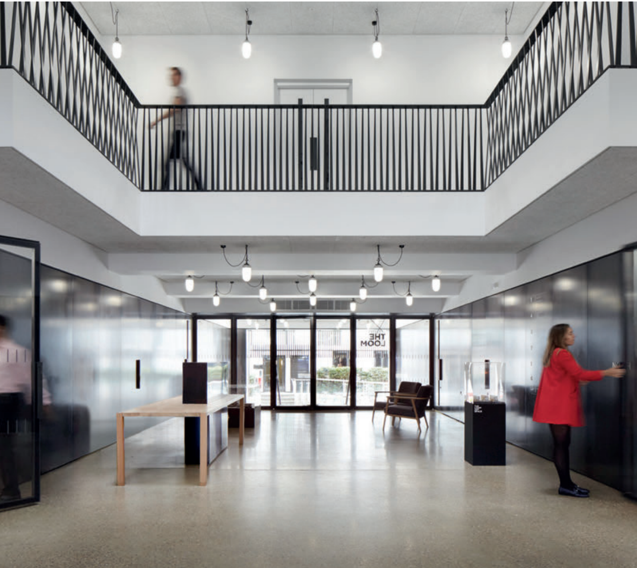
THE LOOM, LONDON E1